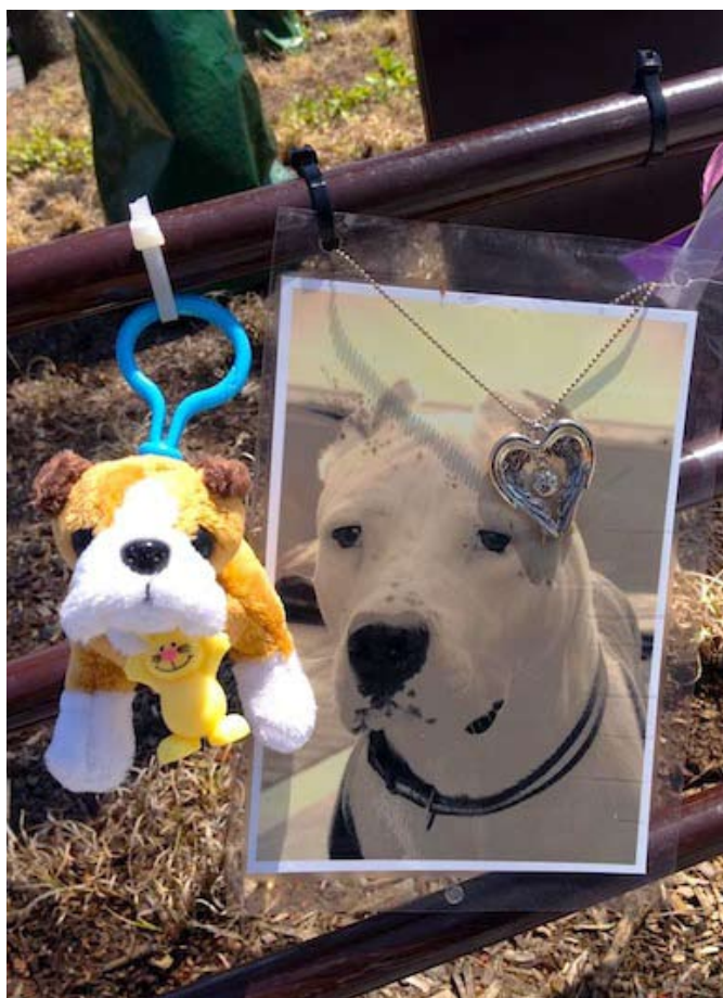
Baby Girl was running away from officers when she was shot, according to witnesses.

"In fact, dogs are seldom dangerous. [Around the same number of] people are killed by lightning each year than by dogs. Despite the increase in the number of dogs and people in the United States, dog bite-related fatalities are exceedingly rare and have not increased over the last two decades."